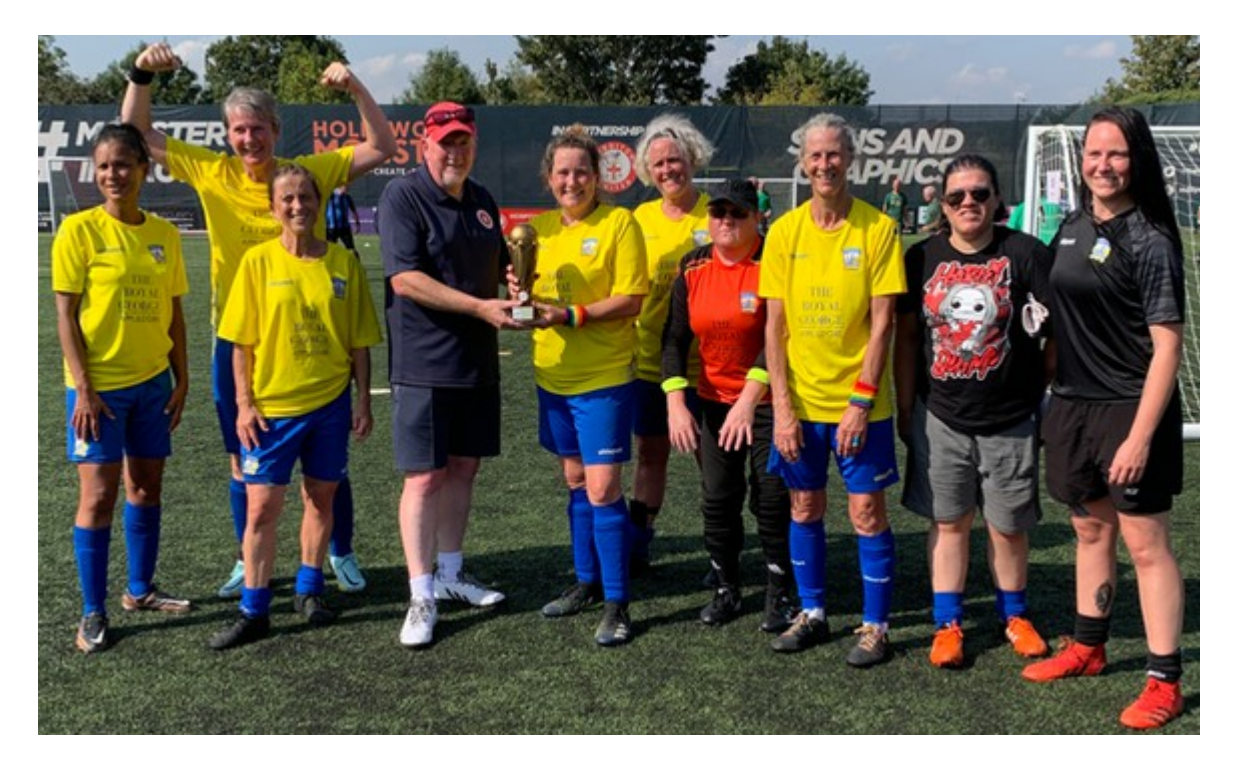
Braunton Women's Over 50s