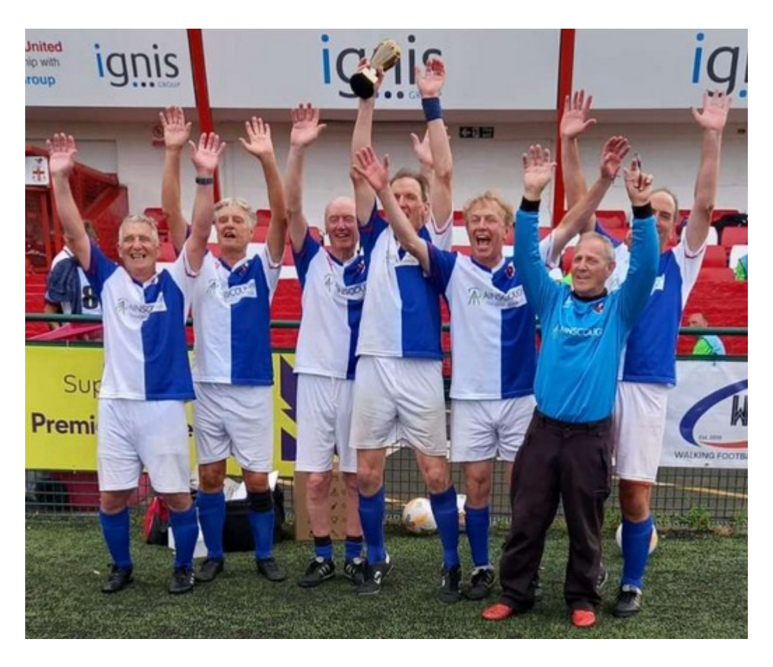
Blackburn Rovers Over 65s