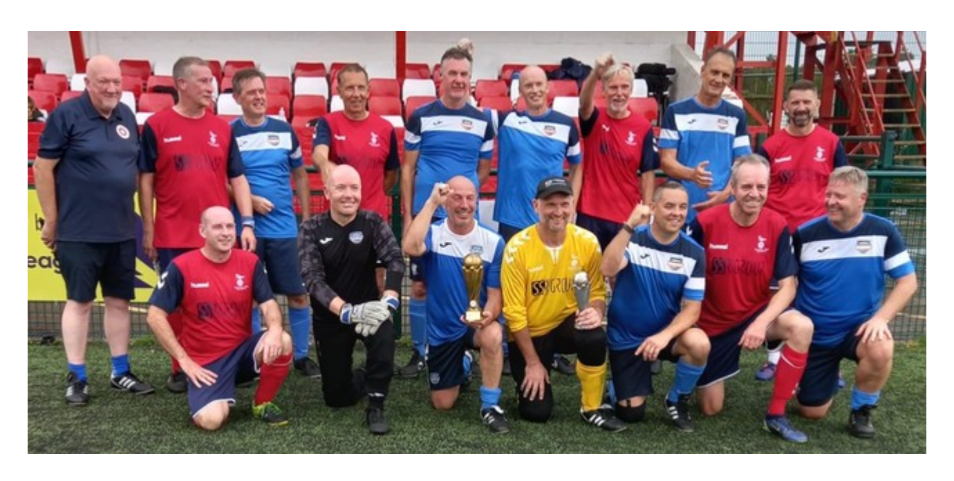
Bolton Arena Over 50s