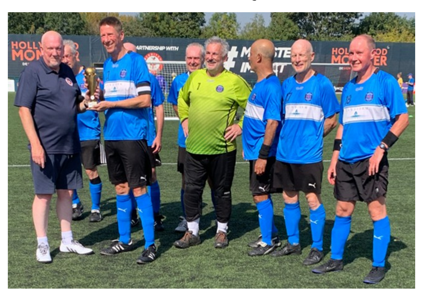
Godalming Over 60s